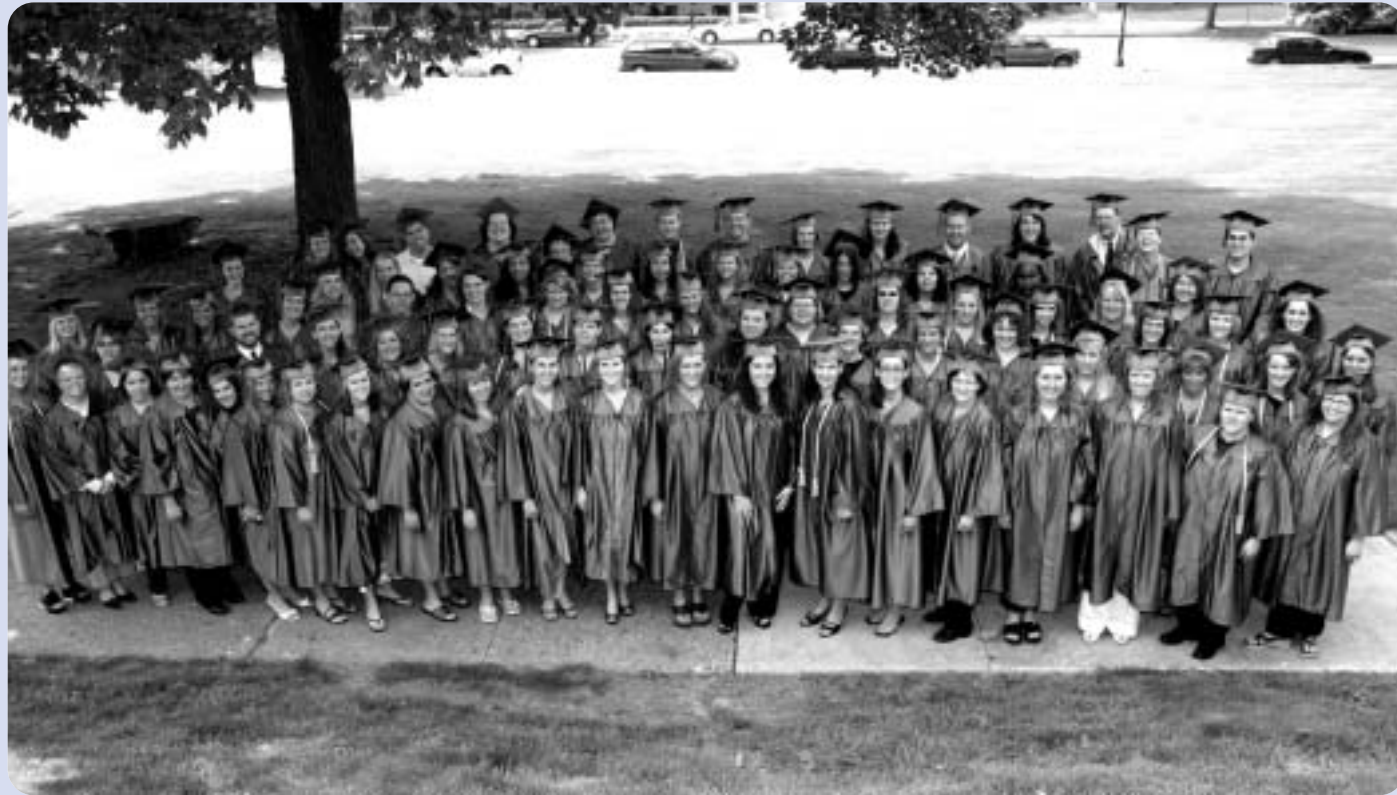
ASSOCIATE OF SCIENCE IN NURSING GRADUATES

core values. You know what they are: reverence, integrity, compassion, and excellence (RICE).