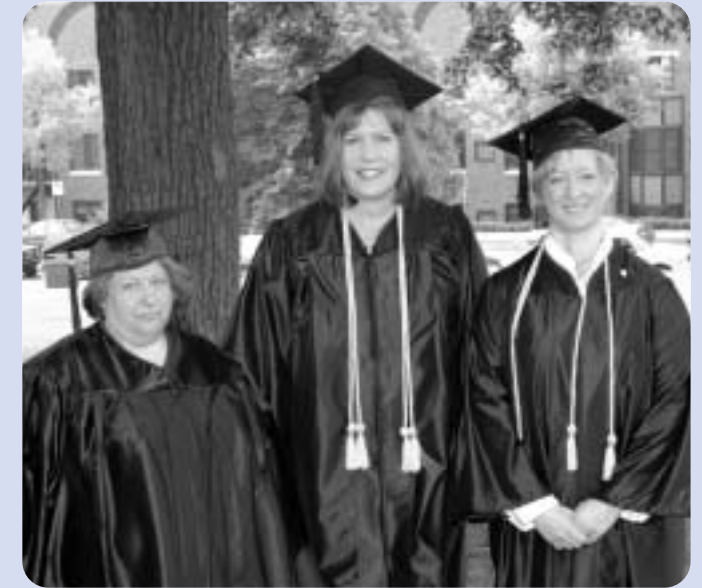
BACHELOR OF SCIENCE IN HEALTH CARE MANAGEMENT GRADUATES