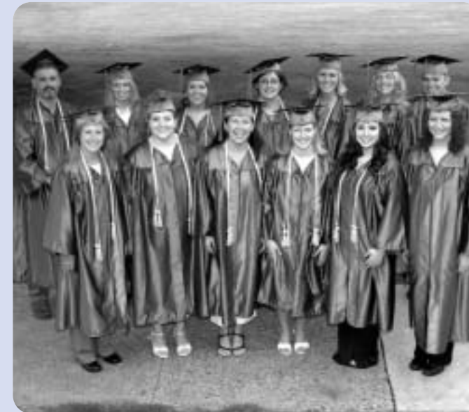
ASSOCIATE OF SCIENCE IN DIAGNOSTIC MEDICAL SONOGRAPHY GRADUATES

It was a great honor to be able to speak to you this afternoon. I am humbled by it. Thank you. Good luck to each and every one of us in the class of 2005.+