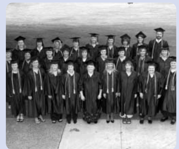
BACHELOR OF SCIENCE IN NURSING GRADUATES