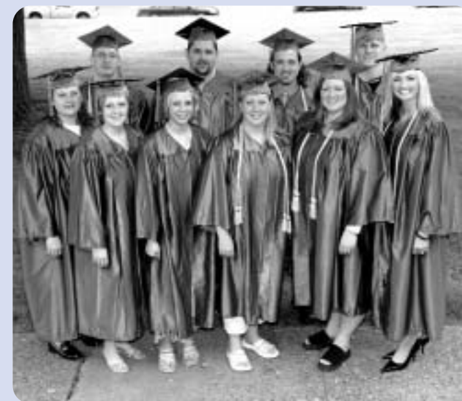
ASSOCIATE OF SCIENCE IN RADIOLOGIC TECHNOLOGY GRADUATES